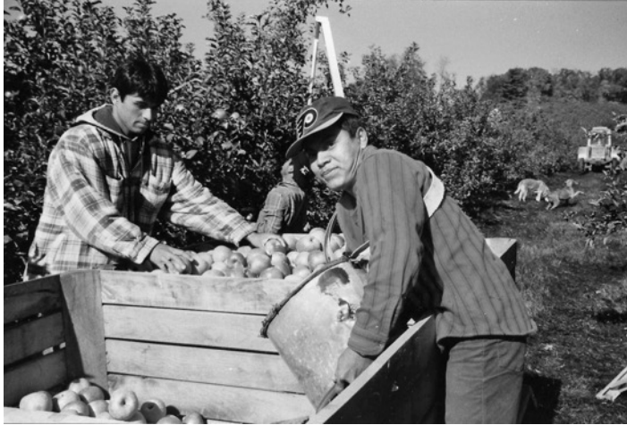
Apple pickers and bins in Adams County.

Some former Mexican migrant workers have decided to settle in the small towns that dot the county, particularly in municipalities such as Biglersville, York Springs, and Gettysburg. They, in turn, support other family members who come to work in area factories and restaurants. These more permanent residents are in the process of establishing a transnational Mexican community in Adams County, a development that has introduced the region to new degrees of linguistic, racial, religious, and cultural diversity. For this reason, the region provides a rich site for students interested in learning about ethnicity and multiculturalism in the U.S.