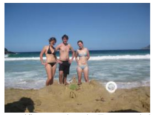
The magnificent sand castle. Turrets and all.