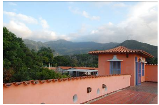
The view from the balcony of our hotel gave great views of a cloud forest national park in the background.

The students broke off into smaller groups after breakfast, whether to explore the downtown shops, find a telephone booth, or see the plaza. Yet the group was soon enough reunited on the beach, drawn collectively by our magnificent farmers' tans. We spent the afternoon in the sun: tanning, building sand castles, swimming, and reflecting on the trip thus far.