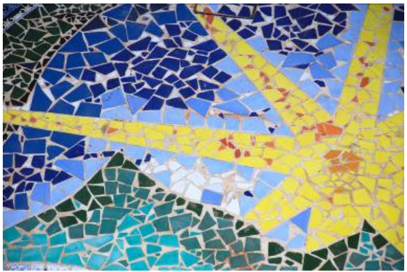
In the courtyard of the posada (inn) was a beautiful mosaic of the sun setting over the mountains in Choroni.