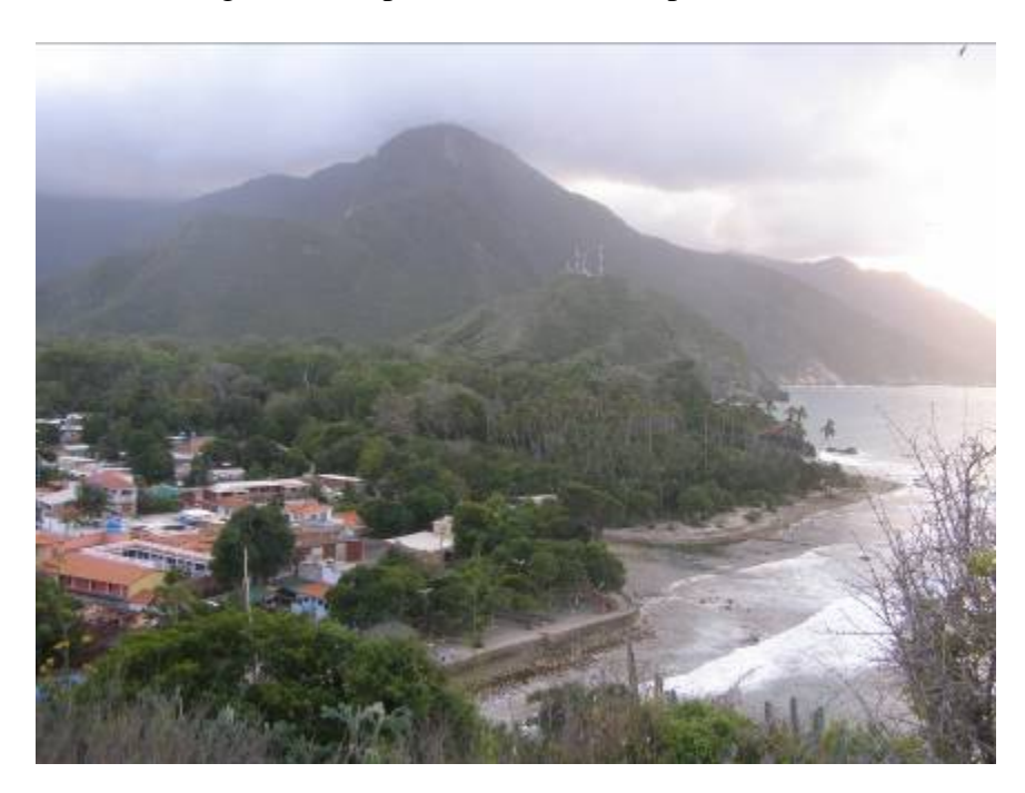
View of the town from a bluff. Our posada is the red rooftop with the columns on the far left.